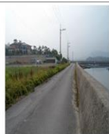
미등록 토지 및 항구